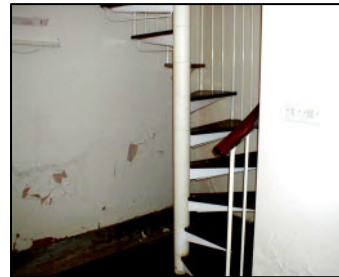
Water pooling after heavy rain

This house is a Large Victorian property converted into flats. The basement of this flat was used as the bedroom. After heavy rainfall the basement flooded due to the failure of the existing waterproofing system. Water pooled to a depth of 5cm throughout the basement area. The tenant had to vacate the property whilst the landlord allowed the area to dry out and subsequently improve the living condition of the bedroom.