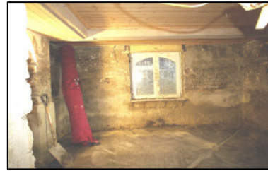
Before the conversion

A Victorian property with a cellar converted into a playroom by the previous owner. Unfortunately there had been no attempt made to waterproof the area so when the new owner viewed the property there was 600mm of water present in the basement rendering it unusable. The new owner wanted to convert the area into a dry and usable area to be used as a television lounge with a separate utility room incorporating a photographic dark room.