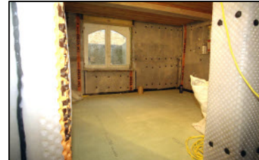
Membrane applied and floor laid.

Floor and wall surfaces were prepared including the removal of electrical fittings. A sump pump was supplied and fitted. The sump collects the moisture that has drained via the cavity. In this case, as part of the cellar was to be a utility room, it was also designed to contain the water that drained from the washing machine. When the water reaches a predetermined level the pump is triggered and the water is removed to a street level sewer.