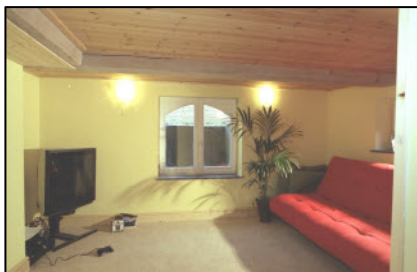
The Finished Conversion

Due to the history of flooding a second pump was installed for redundancy and because the area was known to suffer from power cuts a generator was provided that could be quickly brought on-line and would enable the system to continue operating whilst the house was without power. To prevent flooding to the completed conversion in the event of a complete power failure, a battery backup unit was supplied and fitted.